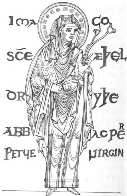
S. Etheldreda (from an ancient Saxon miniature, A.D. 980).

that she made some very great mistakes, and that in endeavouring to put these right she was not just or fair to others. Her story brings before us, as you will see, some